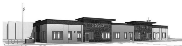
NORTHBRIDGE BUSINESS CENTRE -