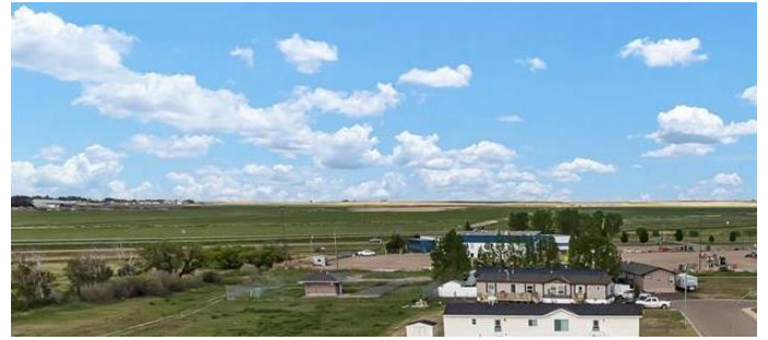
127 Meadowplace Dr E, Brooks, AB

Main Floor Exterior Area 1517.55 sq ft Interior Area 1381.31 sq ft