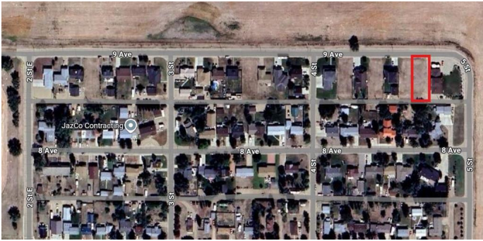
Town of Bassano Vacant Property Listing Details

BEAUTIFUL BASSANO - Welcome to an incredible opportunity to build your dream home in vibrant Bassano for only $5,000! This prime lot has all town services conveniently run to the property line, ready for your vision. Enjoy Bassano's charming community with an outdoor pool, local arena, parks, and a revitalized downtown. Buyers must submit a development permit application within 6 months of signing for a taxable improvement per LUB 921/21. There is also a build timeline requirement and minimum build size of 1400sqft with a front attached garage. Allowed property types include Prefab Homes and Stick Build. Mobile homes are NOT allowed. Call now to get more information as we have multiple lots available!