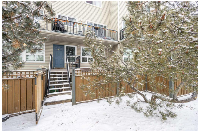
107-3615 49 St NW, Calgary, AB

Main Building: Total Exterior Area Above Grade 404.85 sq ft